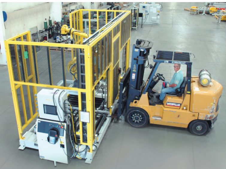
Portable RIO can be transported to the work area via a forklift truck—deployable into many areas