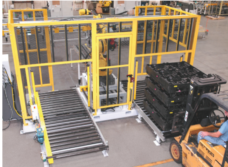
Ecoclean RIO loads and unloads parts, clears system bottlenecks, and processes parts when an operation is down or starved

RIO pack-in applications can eliminate a system starved condition, typically found when an upstream machine or operation has broken down. The RIO is delivered to an area where the system has been starved for any reason. Once in place, forklift trucks deliver trays of parts to the RIO's incoming conveyor lane, and the trays of parts flow to the robot. The RIO robot unloads parts from the incoming trays and loads them onto the existing conveyor or automation. This allows the downstream automation to continue functioning. Once a dunnage tray has been emptied, the robot transfers the tray itself to the RIO's outgoing conveyor, which delivers a full stack of empty trays to the forklift truck interface zone.