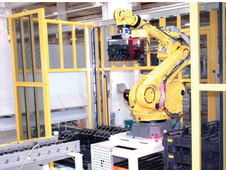
RIO's vision guided robot eliminates the need for proximity switches, part sensors, and locating pins