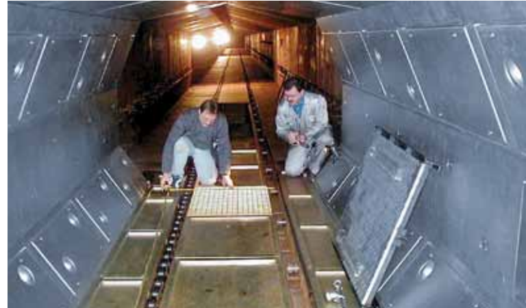
The Dür experts examine all processes and plant sections very thoroughly.