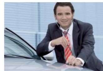
Fully checked with FAStronic.