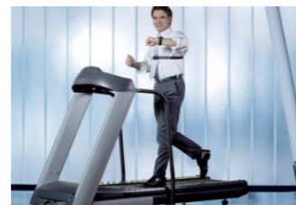
FAStest – for optimum results.