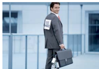
FASsembly – the perfect match.