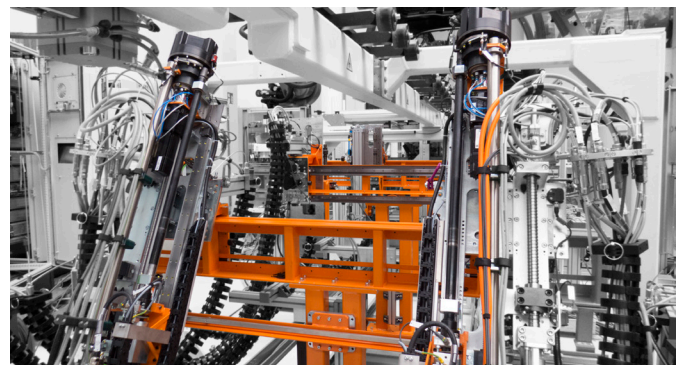
Bolting station x-bolt with bolting system x-gun