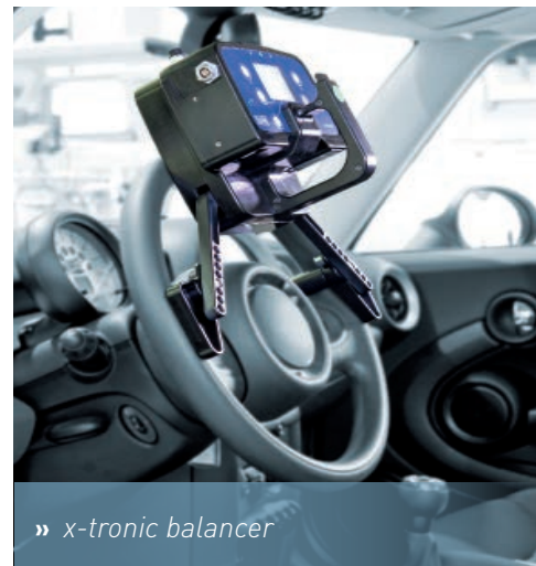
» x-tronic balancer

Using the integrated diagnostics interface of the balancer (option), the test stand PC can do diagnostics tasks and ECU parameter set-up in parallel to the chassis adjustment tasks.