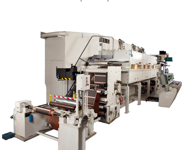
Pilot coating line