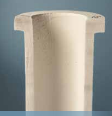
Section showing filter flange design